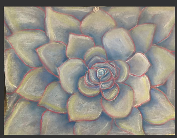
Next we will be working on Watercolour painting, Mixed media coffee cup designs, acrylic painting and more. Students are hoping to work with clay before the end of the quarter.